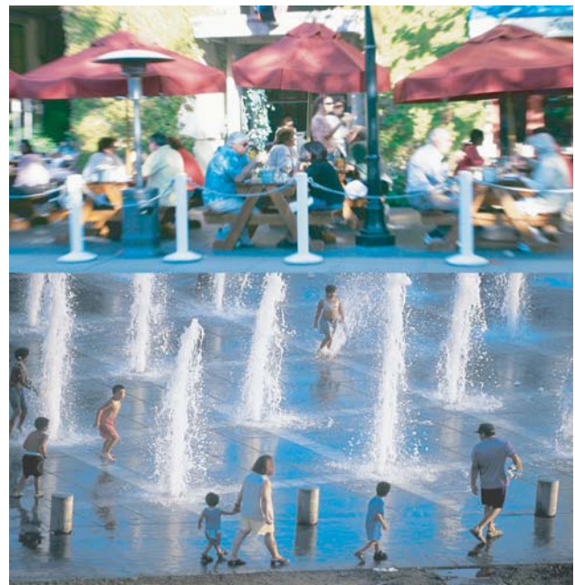
Santana Row and Cesar Chavez Fountain