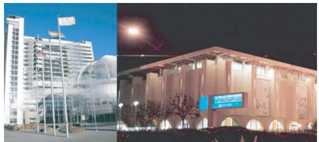
San Jose City Hall and San Jose Library

CHI 2007 does not have a designated customs agent. If you are shipping materials from outside of the country, we strongly recommend that you procure the services of a contact customs agent. Please take into consideration that deliveries of goods by airplane take at least a week and deliveries by ship can take 6 to 8 weeks.